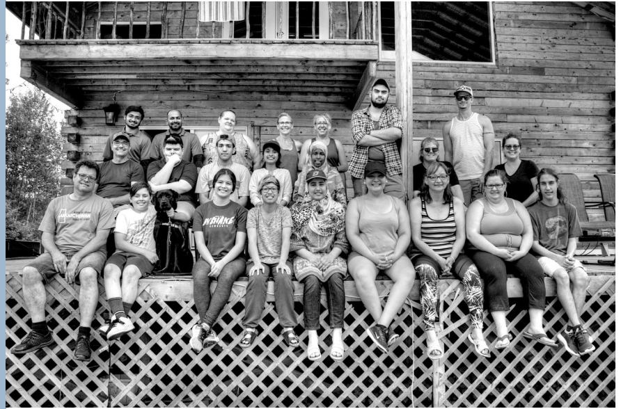
Quick Skills Camp Group