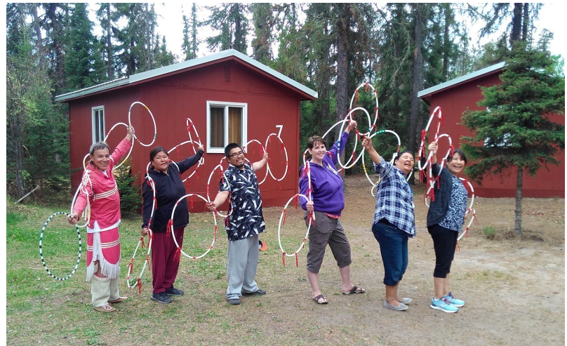
CDF Support Workers