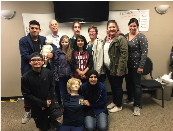
First Aid Regina