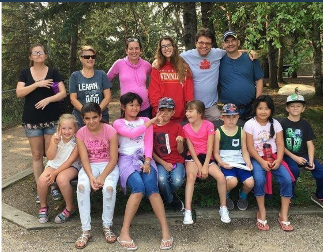
Summer Camp 2018