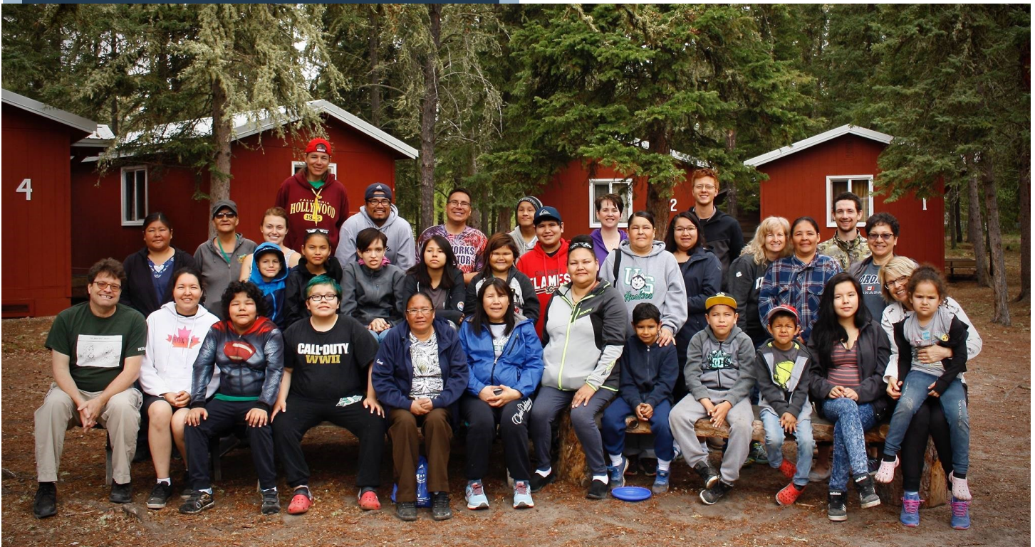
CDF Group 2018