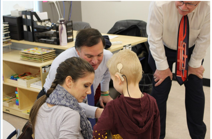
CCCC Preschool Grand Opening

We want to thank our volunteer board for all of their hard work throughout the year.