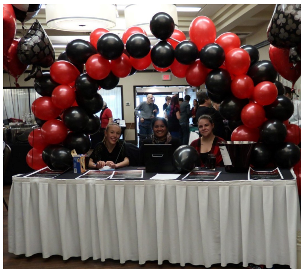
High Steaks Fundraiser 2018

"It had been so true in my life that the time I spent helping others has been the most rewarding"