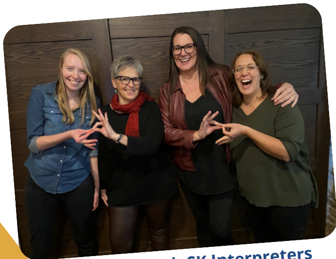
SDHHS' North SK Interpreters