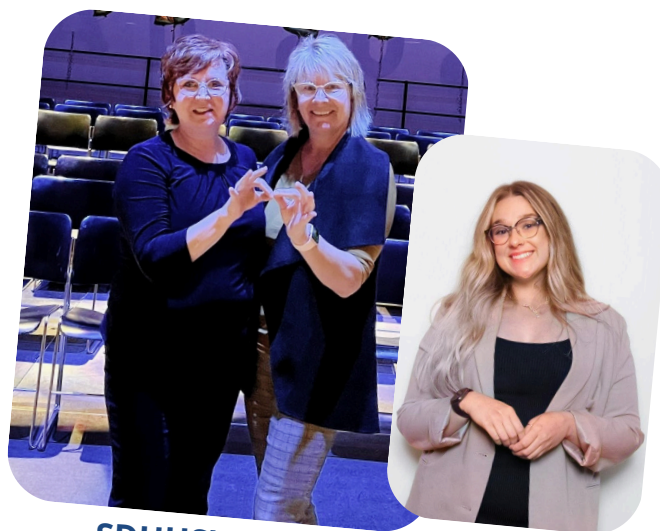
SDHHS' South SK Interpreters

FUN FACT: TOTAL HOURS INTERPRETED FOR THE YEAR... 3354 HOURS!